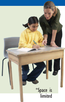
*Space is limited